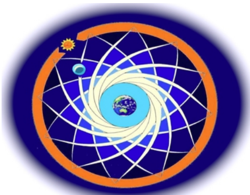
An introspective matriarchal view of our planetary system sees the "photon effect" that lights the Earth.

In this mood I mapped my experience of the light coming from these two heavenly bodies in the course of a year and came to see how together they form a "photon of whole Light". It is in my opinion this photon effect that then lights the whole Earth. The idea of this photon effect, this field of feminine power and masculine strength pulsating around this planet for several billion years, moves me to think that here is the cause of the Earth being so vital and fecund and healthy.