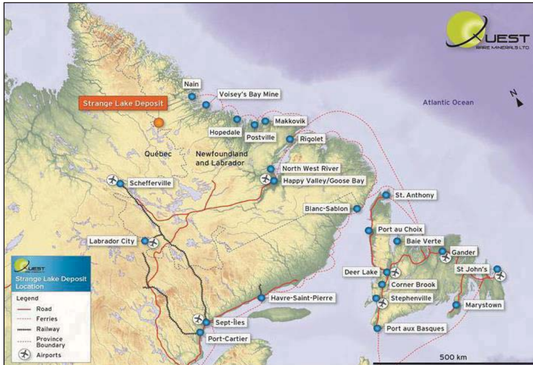
Figure 4.1 Location of the Strange Lake Property