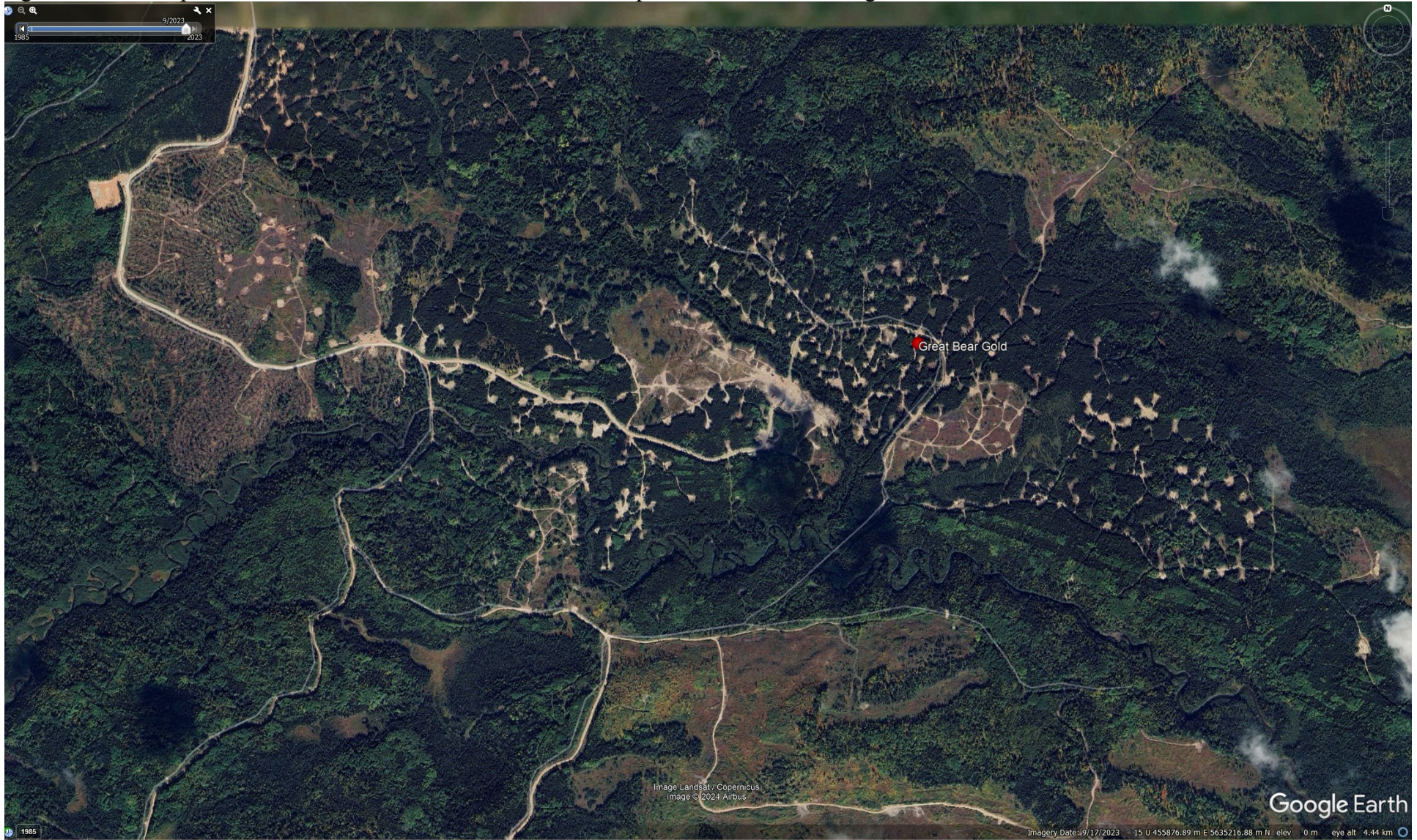
Fig.1 Visible drill pads at the Great Bear Gold site- Scene dated September 17 th 2023.