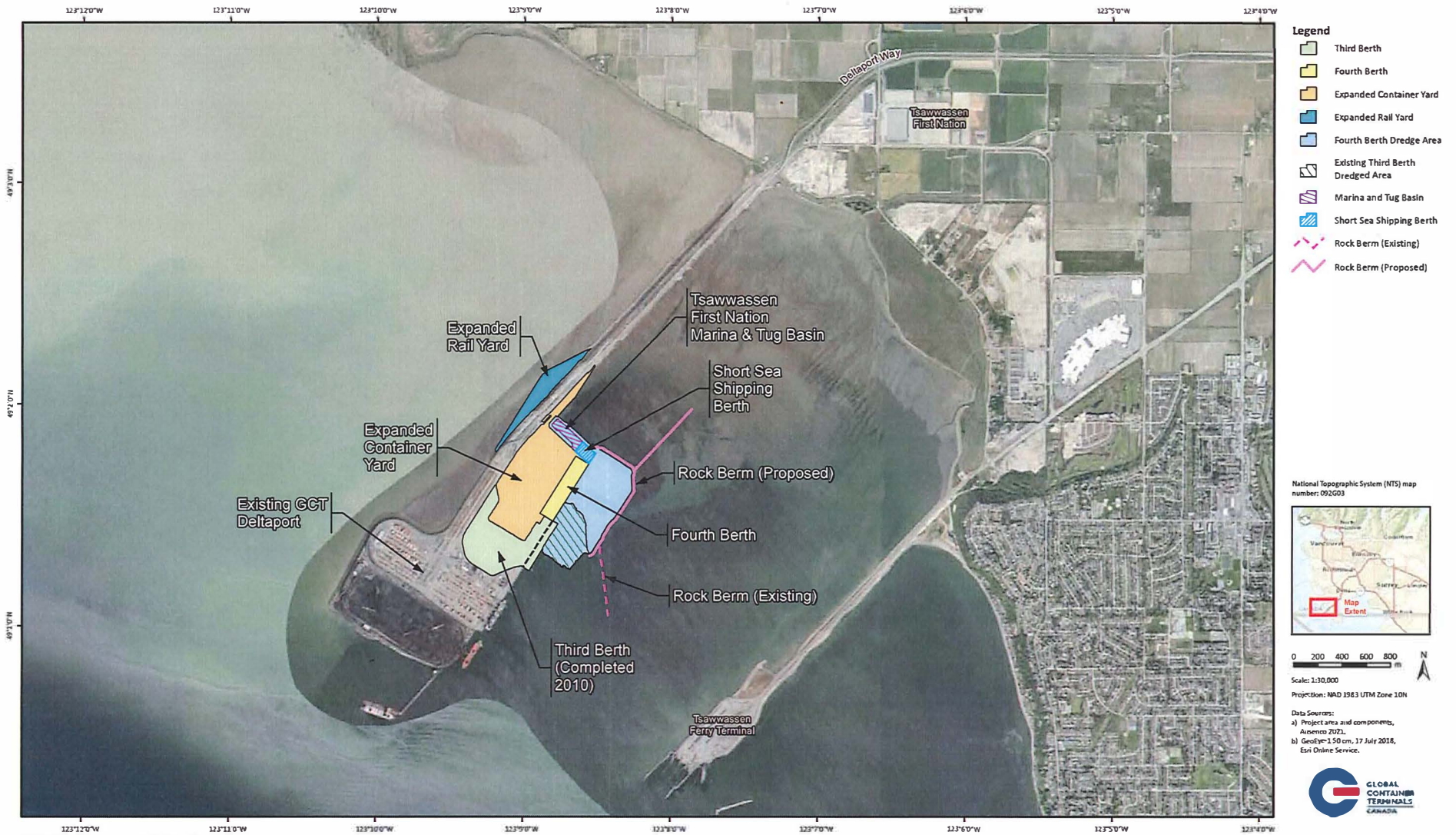
Figure 1: GCT Deltaport Expansion, Berth Four Project Area.

GCT Deltaport Expansion Berth Four Project